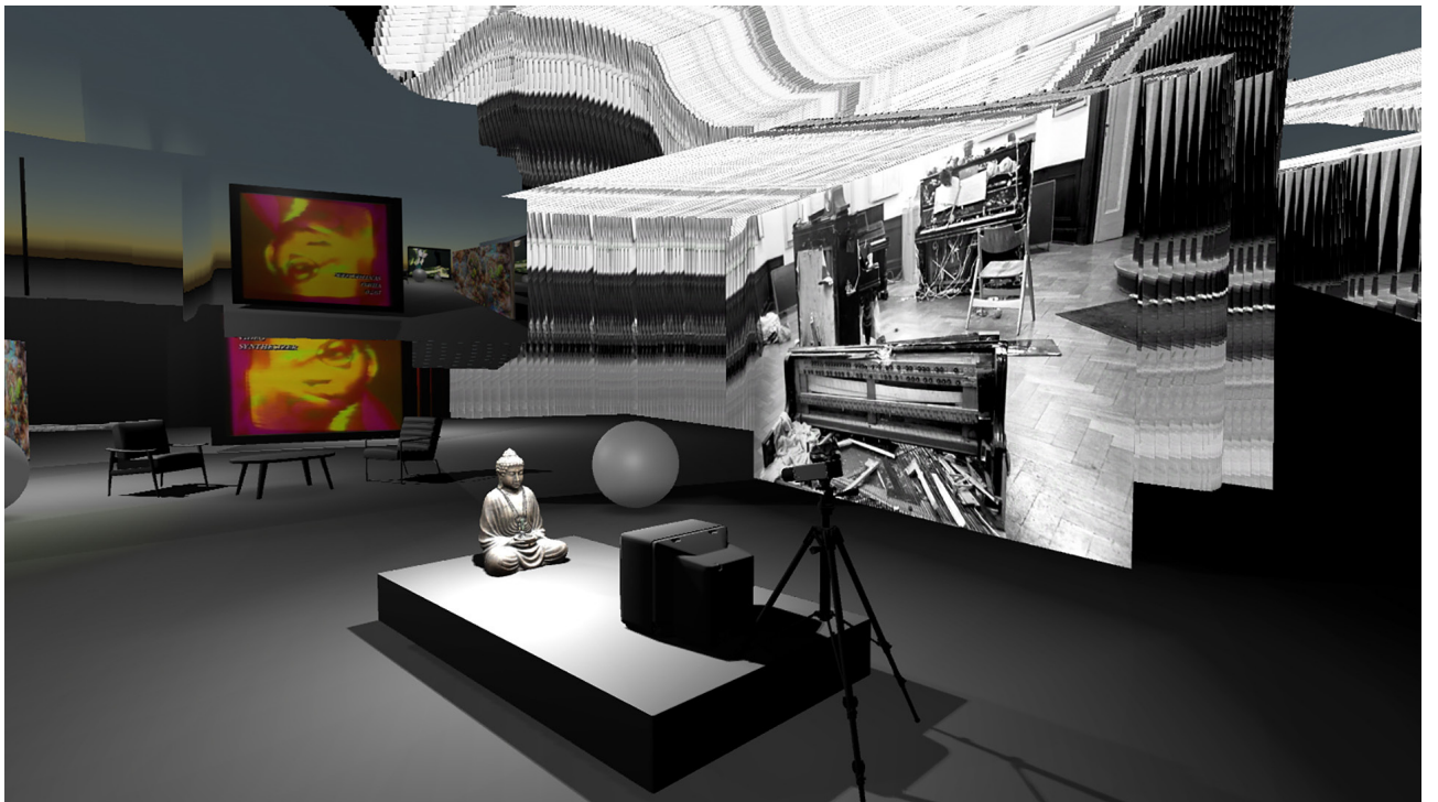
[Img. 1 - 3]